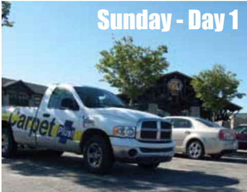
Sunday - Day 1