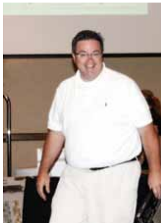
"And, Again" with the token smile