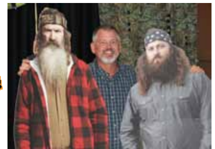
Beard in training