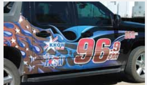
Big Country was on Location at Topeka Carpet Plus Aug 24th.

In Brazilton, one couple was celebrating 73 years as they had a dog. In Topeka, a customer was secured for life after winning a 9x12 area rug. And, in Independence over 25k in Sales was reported despite a rainy second day.