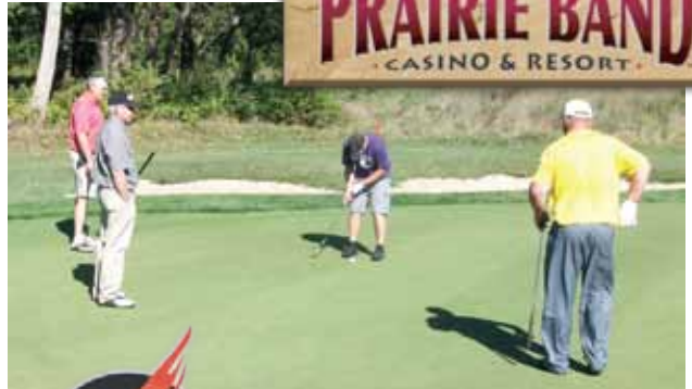
The "seasoned" golfers