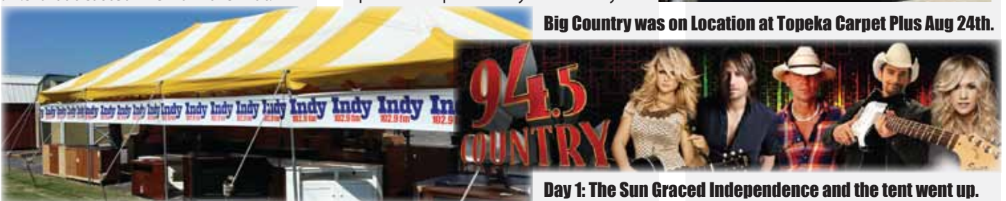
Day 1: The Sun Graced Independence and the tent went up.