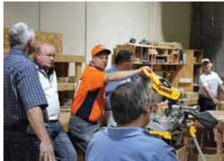
Jeff is NOT allowed to play with power tools!