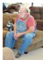
Customer decided to sit a spell